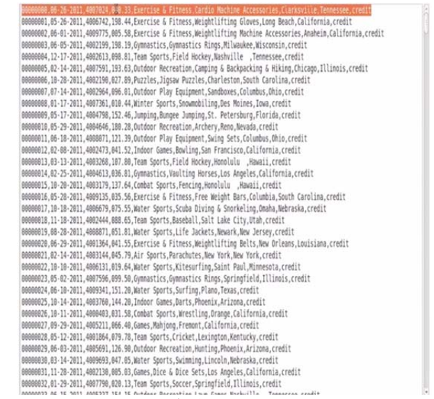
Fig 2.Raw Data