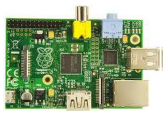
Figure 1 Porting OS on pi

ARM board provide high speed, better accuracy, good flexibility and low cost solution for development of embedded system. Using ARM board as development platform speed up the process of development. Raspberry pi Model B (as shown in figure.1) is currently most popular ARM board. It has a Broadcom BCM2835 system on a chip SoC, which includes an ARM1176JZF-S 700 MHz processor, VideoCore IV GPU, and is shipped with 512MB of RAM .It does not include a built-in hard disk instead it uses an SD card for booting and long-term storage. It comes with two USB ports, RJ45 Ethernet port, HDMI port and RCA output on board.