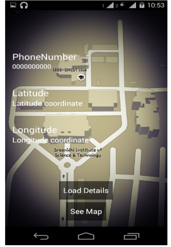
Figure 3: Smaps data screen

The username and branch should be entered in the above screen to retrieve the information of that person. The information retrieved is shown in the next page.