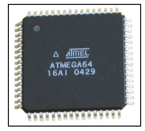
Fig. 2 AT Mega64 microcontroller

Since our hardware will be smaller, it will be easier to attack without any long procedure. The microcontroller is shown in Fig. 2